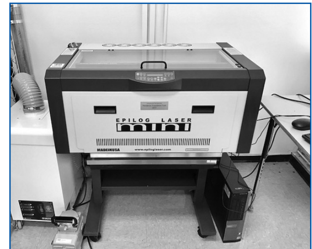
Epilog Mini 40 Laser Printer

Go to https://spark.adobe.com/page/7QYf67gOrSioy/ to see a video highlighting several of the programs offered thru the CTE program and School District 16R. The Pendleton Foundation salutes the staff of the CTE program and is honored to support PHS.